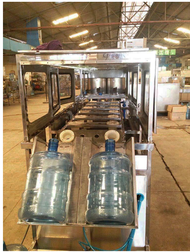
200B/H Gallon Bottled Water Filling Machine