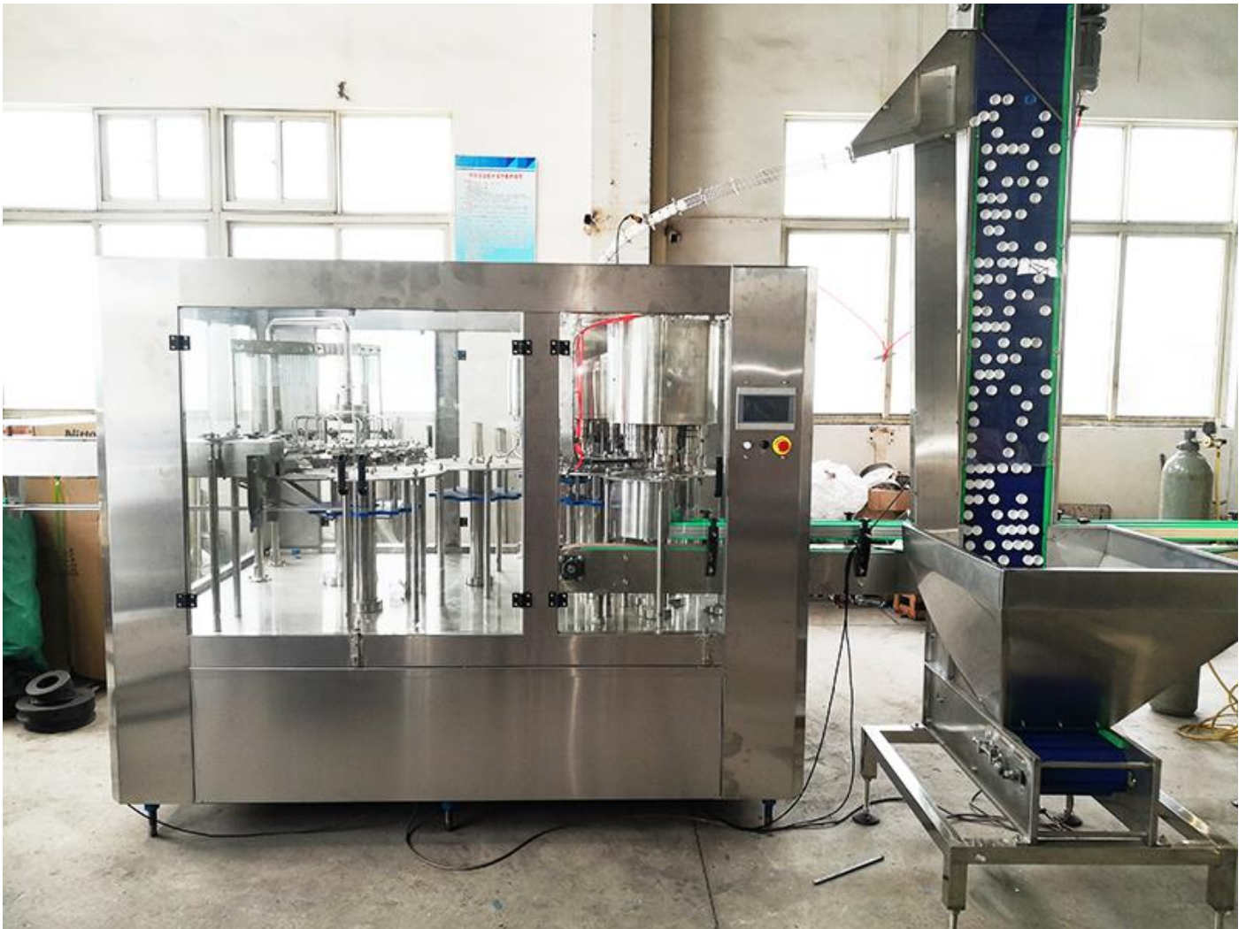
3 In 1 Mineral Water Filling Machine